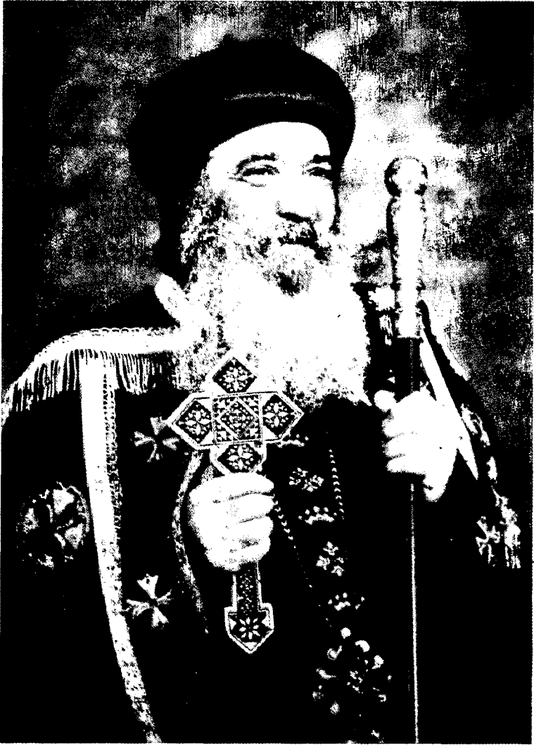
H. H. Pope Shenouda III, 117 th Pope of Alexandria and Patriarch of the See of St. Mark