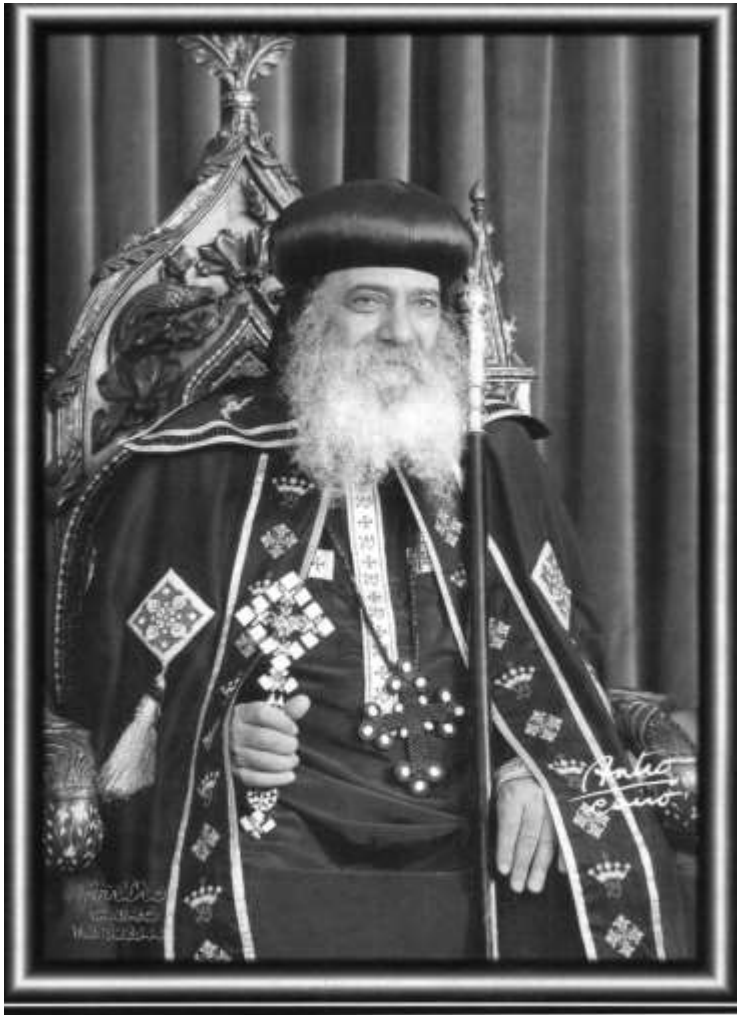
H.H. Pope Shenouda III, 117 th Pope and Patriarch of Alexandria and the See of St. Mark