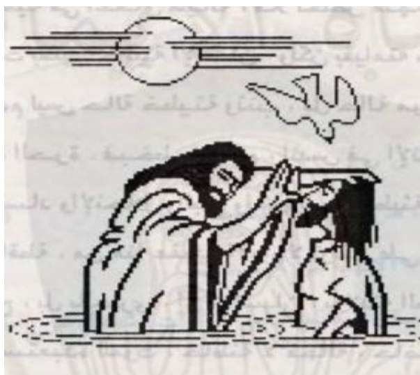
The Coptic Orthodox Church

"With baptism, the enlightenment of the mind of man, which is darkened by the fall, begins, in which light is given by the Spirit." That is, we personify Him to the Divinity" (pg. 1, 2, 8, 12).