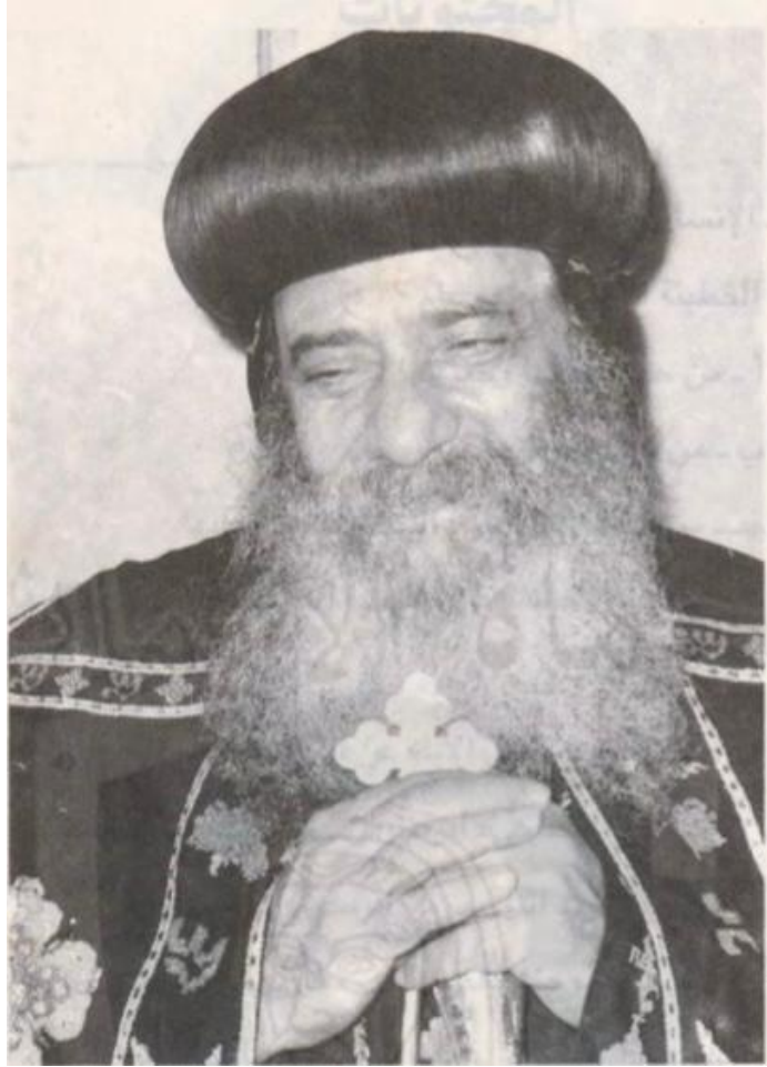
Pope Shenouda III

The Pope of Alexandria and the 117th Patriarch of the See of St. Mark